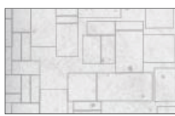
natural stone paving