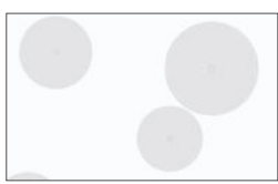
tree outside plan area